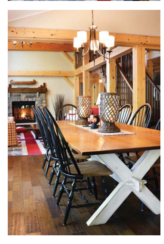
TOP LEFT: Chestnut Lane Kitchen & Bath built the efficient kitchen and supplied the appliances. TOP RIGHT: Tall windows allow lots of natural light to illuminate the great room. ABOVE: A rustic trestle table, with painted legs, seats as many as eight people for dinner.