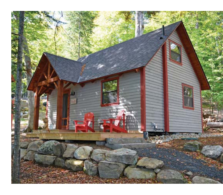
Eagle Landing Company developed this Bigwin Island property where the timber frame construction and finish of this new vacation home extends to its Lake of Bays boathouse and nearby bunkie.

The newest family charmed by this island retreat was drawn by its unique character and the fact that there are no cars on Bigwin. The 520-acre island on Lake of Bays is a short boat ride from the mainland, but it's a world away, secluded and serene, an intimate island community of just over 100 waterfront properties ringing the shore. At its centre is the Bigwin Island Golf Club with an 18-hole championship course. Eighty acres of natural, protected lands - where deer quietly graze and stealthy red foxes prowl - skirt the links and buffer the vacation homes. Continued on page 50